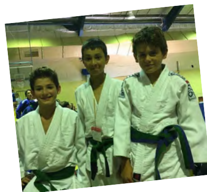
The next generation of warriors