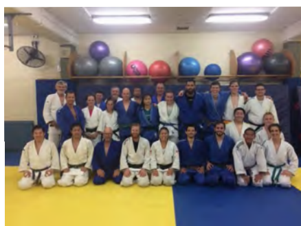
Japanese visitors on 10 January