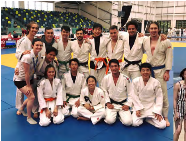
The AUG is always a mixture of business (L) and pleasure (below) and the Gold Coast provided the perfect setting...

Despite some organisational shortcomings, everyone had some great fight experience and enjoyed themselves on the trip.