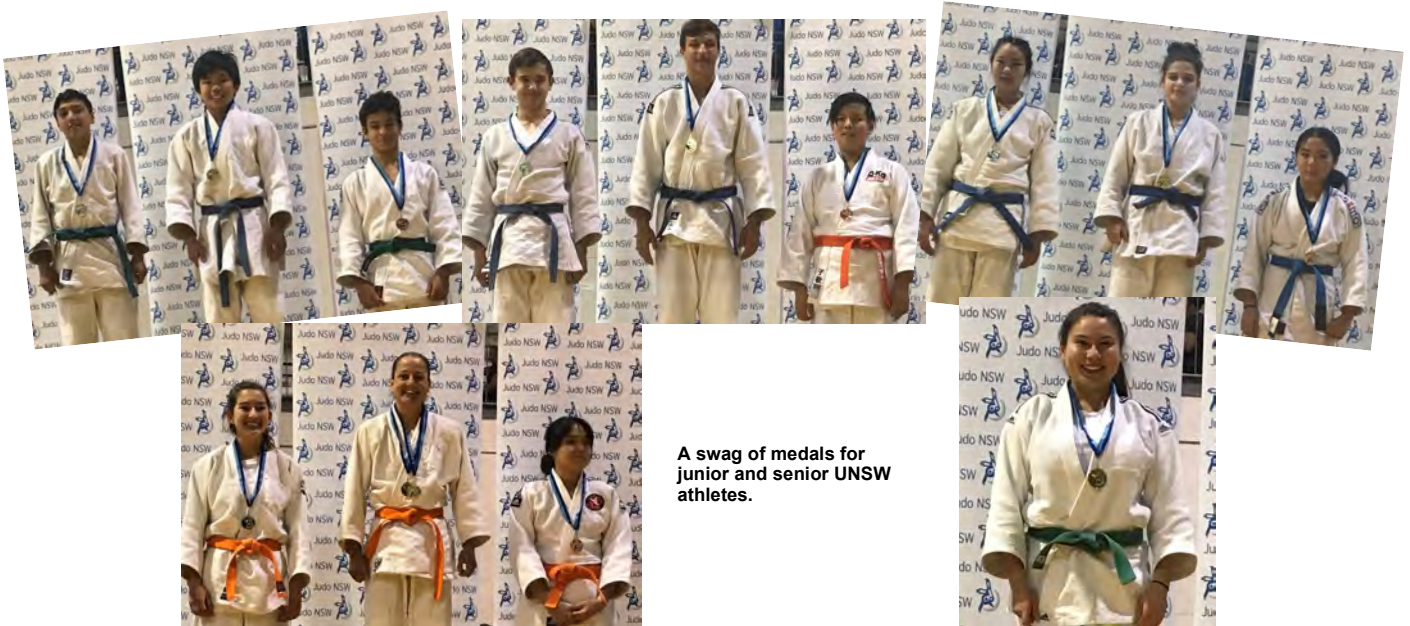
A swag of medals for junior and senior UNSW athletes.